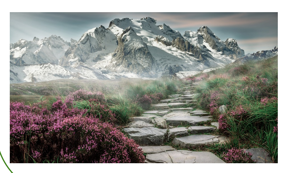
The Bog Baby Resource 5a