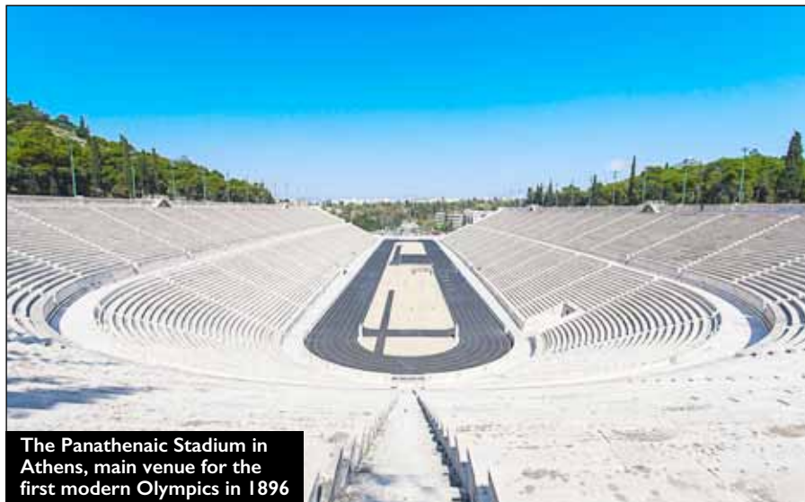
The Panathenaic Stadium in Athens, main venue for the first modern Olympics in 1896