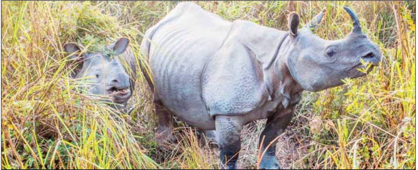
The one-horned rhino has lost much of its natural habitat in India and Nepal as humans use more land for living and farming