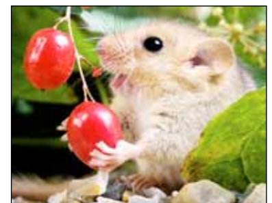
Dormice thrive in woodland

“Dormice are arboreal creatures going from branch to branch and they do best in a shrub environment. They need hawthorn, blackthorn, spindle, hazel – especially hazel – bird cherry and dog rose.”