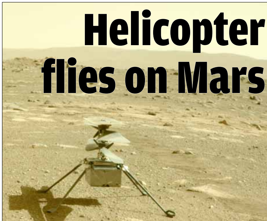
A Nasa photograph of Ingenuity on the surface of Mars, taken from the rover vehicle